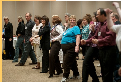
Toastmasters audience participated in the electric slide at Friday Fun Night.